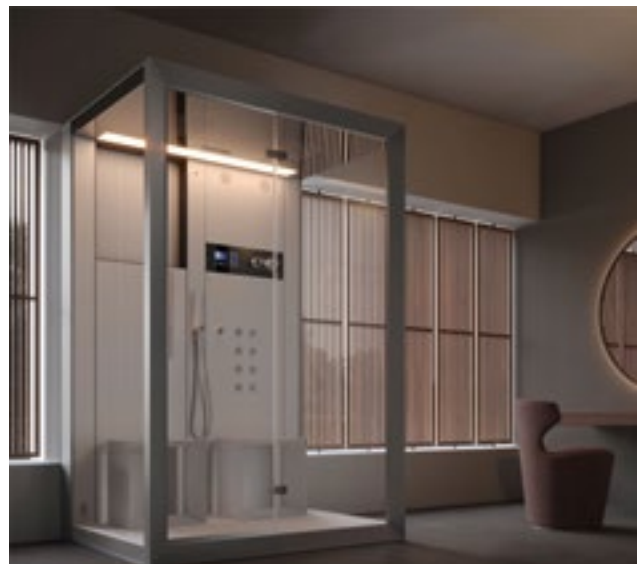
Shower & Steam